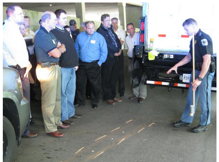
Cobb County STEP officer explains roadway evidence