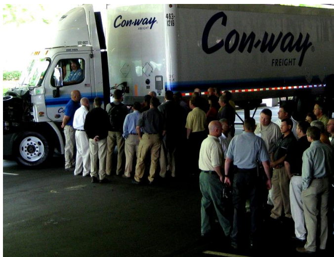
Attendees listen and learn during mock crash scenario