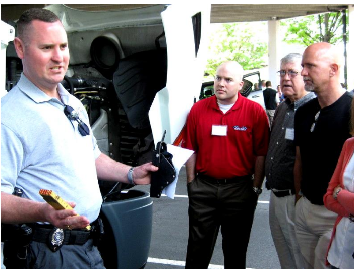
MCCD officer explains Level One inspection process