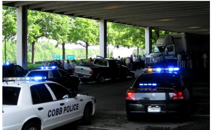
Emergency response by Georgia State Patrol, Cobb County STEP, and MCCD