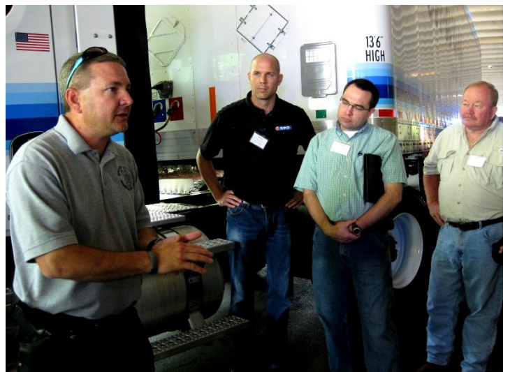
MCCD officer explains driver interview process